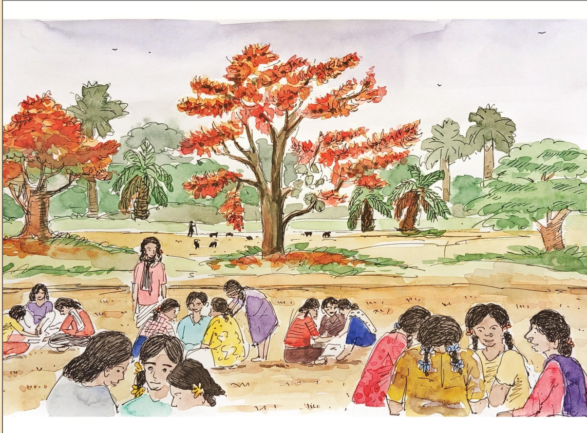
Sketches to Verses - Children weaving poetry where the Palash blooms!

The children embraced the process with enthusiasm. We began with Pakhur Mongarai (Sabar - Birds of Imagination), where the children created imaginary birds as groups and gave them names. Over the next two days, while sitting in fields of Palash or through intense music sessions indoors, the children crafted their own tales about their new imaginary birds. They created and illustrated story cards inspired by their observations in the field as well as by their inherent knowledge of the natural world around them. One of the more striking illustrations has been used as the cover image.