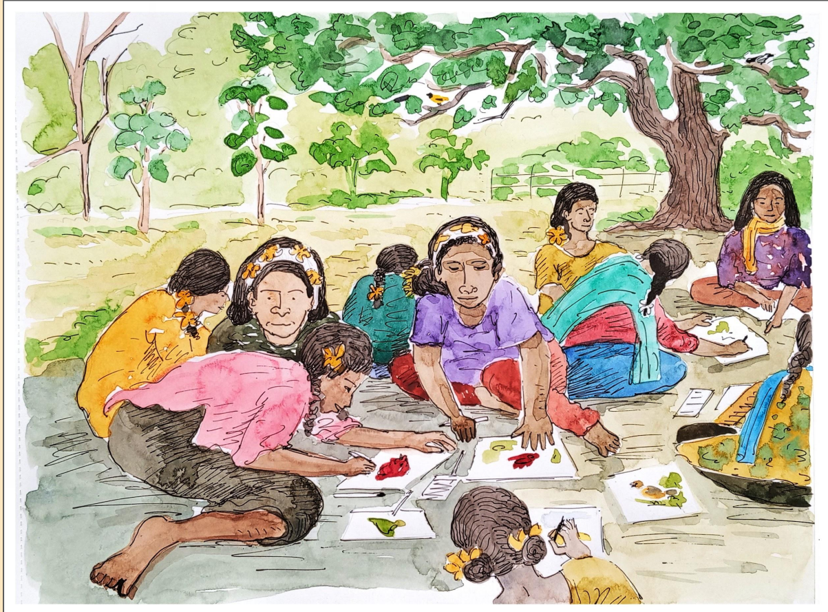
Imaginations take flight as children sketch their dream birds under the canopy of an old tree!

At the onset of spring, while the Palash bloomed in its fiery colours across Purulia, a group of young storytellers wove magic through song at Rajnowagarh. Over three days, forty-six children from the Sabar community came to indulge in their imagination and explore the natural world through their ancestral gift – music. This was the second workshop in our ongoing initiative, Bridging Traditional Knowledge Gaps through Storytelling, organized in collaboration with The Keystone Foundation and the Paschim Banga Kheria Sabar Kalyan Samiti (PBKSKS). What unfolded was nothing short of extraordinary.