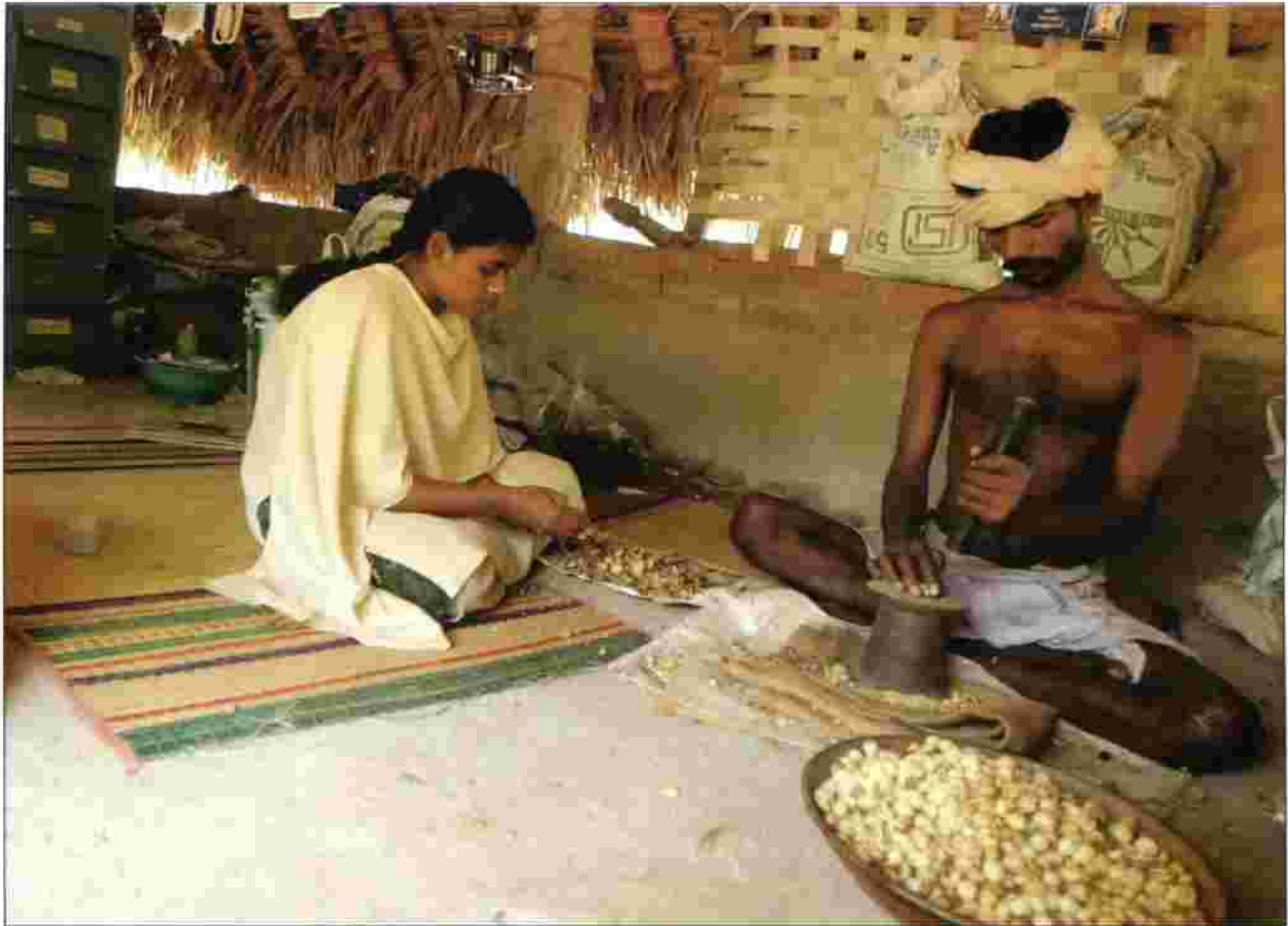
Student learning to prepare herbal medicines.

The habitat and landscape where the sanghas collect medicinal plants for the GMCL enterprise are totally different from that of the Nilgiris. The land is harsh and semi-arid, with few trees. NTFP collection is hard work, which only lower caste and poor villagers are willing to take on. Collectors have to walk long distances to gather medicinal plants. The government Forest Department does not sell collection rights for the land because it is degraded but the land belongs solely to the Forest Department. Local communities have no say in how forest lands are managed. The collection of NTFPs is still within the bounds of sustainable harvesting but the grasslands and NTFPs could be better supported, and more plentiful, if the villagers had some sense of ownership and caretaking over the land.