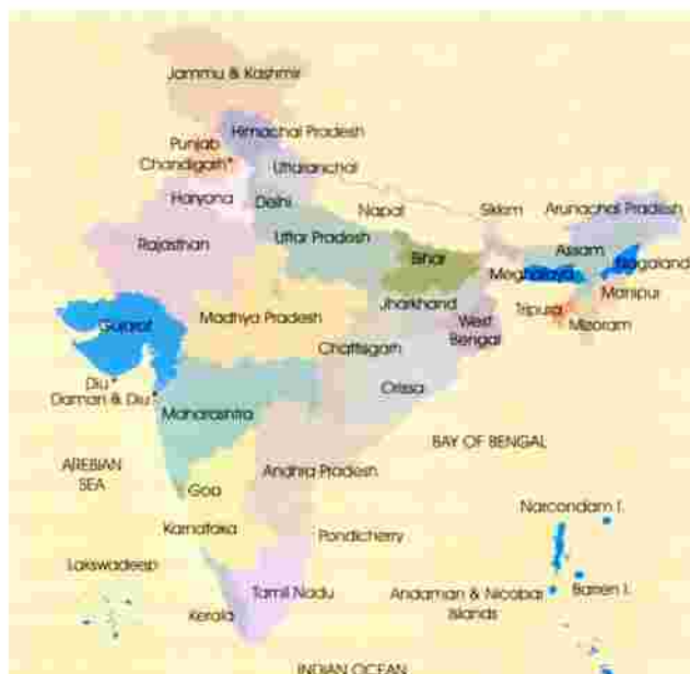
1. Appropriate Technology India 2. Asia Network for Sustainable Agriculture and Bio-Resources 3. Keystone Foundation and Gram Mooligai Company Limited

FRLHT is piloting six medicinal plant "cultivation packages," providing seeds to the farmers and attempting to work out standard operating procedures to ensure good harvests and to mitigate losses due to insects and diseases. However, the cultivation of NTFPs on farms is still in the pilot phase. Yield per acre is low, and standardized packages for the harvesting and sale of cultivated NTFPs are still being developed. Market linkages, while improving, are still tenuous.