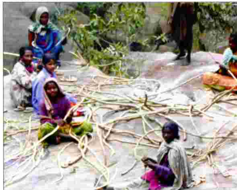
Irula tribal women making rope from forest vines.

FRLHT is piloting six medicinal plant "cultivation packages," providing seeds to the farmers and attempting to work out standard operating procedures to ensure good harvests and to mitigate losses due to insects and diseases. However, the cultivation of NTFPs on farms is still in the pilot phase. Yield per acre is low, and standardized packages for the harvesting and sale of cultivated NTFPs are still being developed. Market linkages, while improving, are still tenuous.