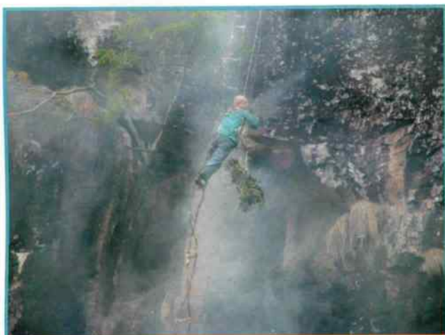
Not the safest looking position to be in, but it's the life of a honey hunter.