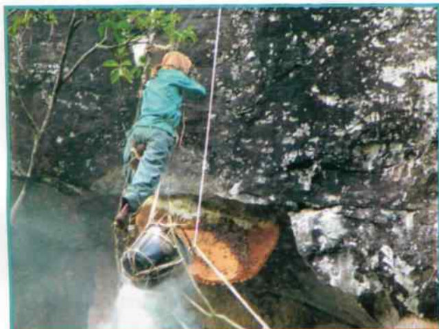
Preparing to smoke the bees off the comb