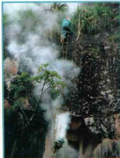
Smoking the colony.

So if honey hunting was right for them, what were the problems associated with this activity? Who are the Keystone people and why do they even need to intervene in these practices? I was soon to find out that while the history of Kurumba honey hunting may have gone back hundreds of years, the problem was bringing this socio-economically and culturally important activity to mesh harmoniously with the modern situation in the Nilgiri Hills. One of the problems was a simple lack of new and young Kurumbas to take up the tradition. With the growing number of tea factories and the deforestation of the entire area to suit their growth, many young men have been leav-