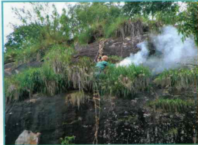
Preparing smoking material

That all sounded fine and dandy to me, but I still wondered, why do things this way? Why not just keep bees like a beekeeper and remain firmly on the ground? The helpful staff members of Keystone explained to me that keeping bees, particularly mellifera , which is an exotic species here, is not always as suitable for tribal peoples as one might think. First of all, beekeeping with hives is more resource intensive, ruling out a large number of poor people, or those less knowledgeable