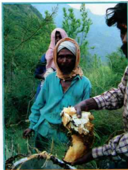
Fresh honeycomb, some of which will be consumed and the rest sold.

large concern, since the Dorsata bees are of the utmost importance to the diversity of the forest sholas. Conservation was stressed as a main theme and local awareness of the forest ecology was raised. Keystone also helped to create a market for the honey of the tribal people, opening fair trade Green Shops and widely distributing information