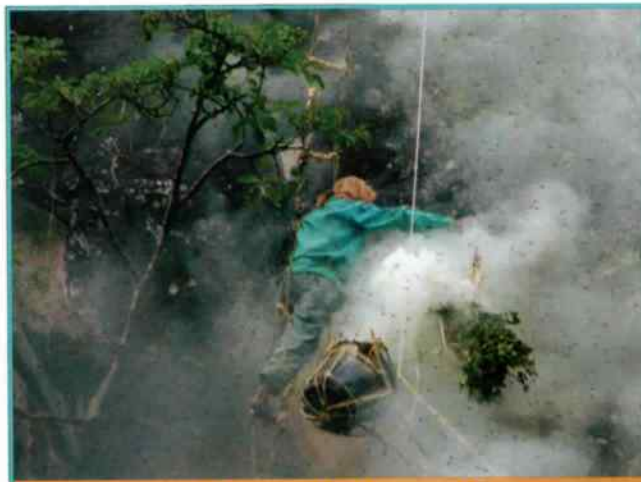
Another angle showing the honey hunter at work

ing the forest to take wage-labor jobs at the tea factories. A loss in cultural significance of honey hunting activity as well meant less tribal community and as a result, fewer and fewer young members taking part.