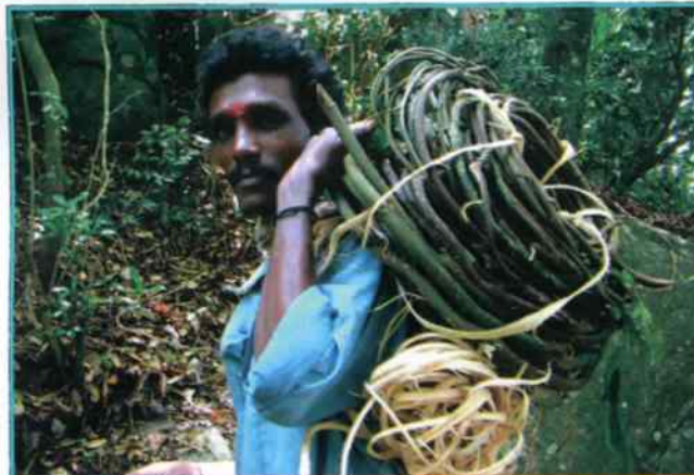
Gathering vines to make the rope ladder

After finding, marking, and waiting for the combs to be ready, the men perform initial ceremonies and form a hunting group. The sounds of hunting songs being sung by the village women echo behind them as they enter the woods. Before the actual gathering of honey can occur, the men prepare smokers and rope ladders from forest vines. They also make a honey collection basket that they weave from leftover vine material they used to make the ladders. The differ-