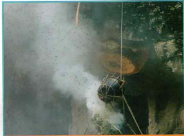
Closeup of smoking brush, catch basket and large comb of Apis dorsata with many flying bees