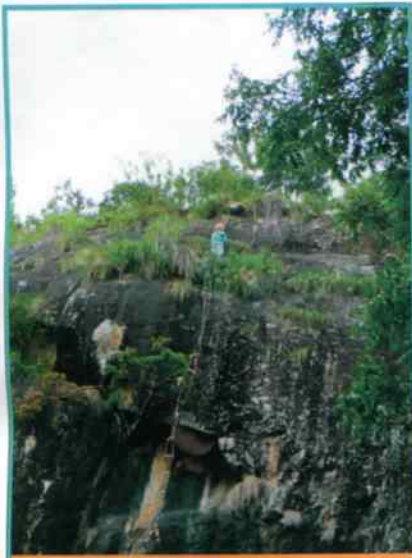
Extended rope ladder and the perilous trip down the cliff

cuts just above the brood portion, and the brood falls to the valley floor where his partners are waiting to collect it.