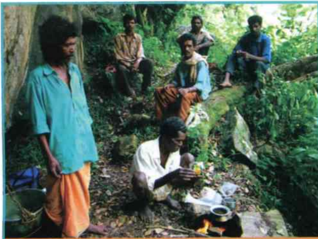
Honey hunters assembled. Each person has an important job vital to the hunt's success.