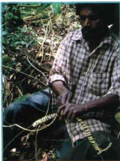
Preparing the rope ladder

to use his smoker as well. The honey basket is lowered by rope to the hunter. His bamboo spear is what cuts the comb; this requires a great deal of skill, as the hunter is still dangling freely in the air. There are thousands of giant bees flying everywhere. With the skill of a professional, the hunter