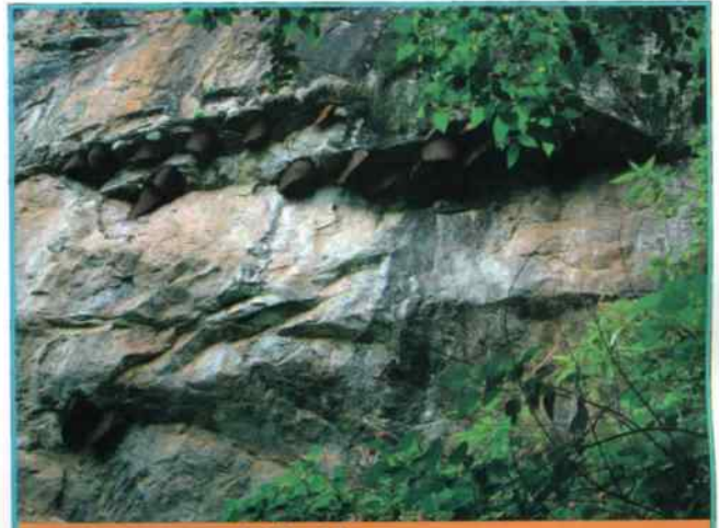
Cliff with numerous Apis dorsata combs and bees

the flowers as well, to be sure the requirement of pollen and nectar has been collected and hopefully capped off.