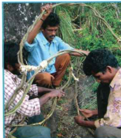
The ladder is made from locally gathered vines and carefully assembled