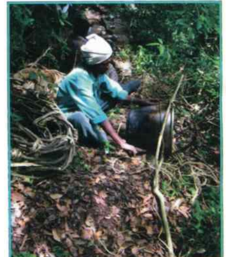
Preparing the basket that will hold honey combs.