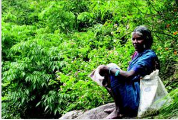
Traditionally tribal communities have been collecting honey from the wild

Innovations in beekeeping (movable frame hives, top bar hives and clay hives) have helped promote bee keeping amongst farmers and tribal communities around the Nilgiri Biosphere Reserve.